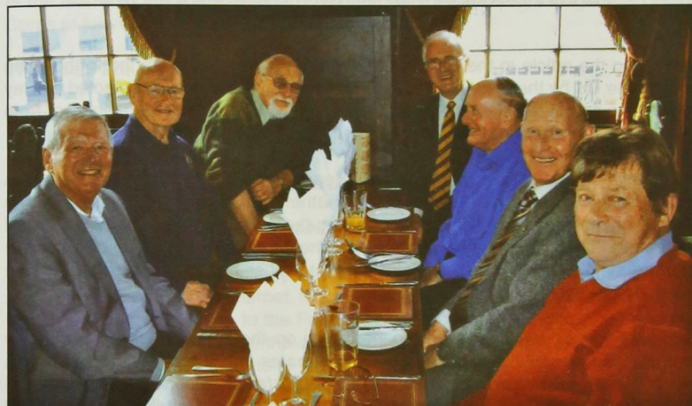
Members of the Mortar Platoon on the occasion of their 55th Reunion