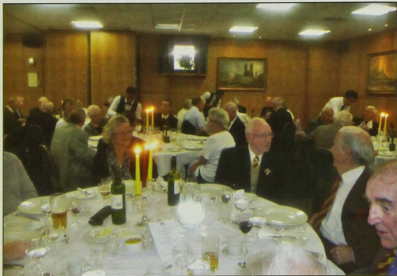
Members of the Korean Club at the last reunion Union Jack Club - September 2012