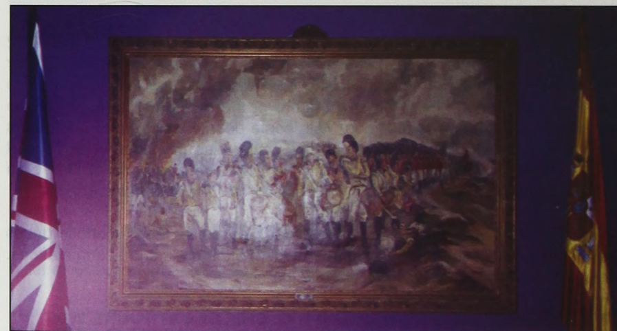
"Steady The Fives & Drums" Presented by Enfield Branch. Displayed in in the Albuhera Museum

The events then moved to Wellington Park where the Regimental Memorial is sited. We were joined by the Spanish Army contingent, Guardia Civil and the inhabitants of the village where wreaths were laid by the Mayor of La Albuera,