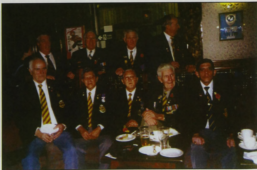
Association members in the W.O's & Sergeants Mess Mill Hill on Remembrance Sunday.