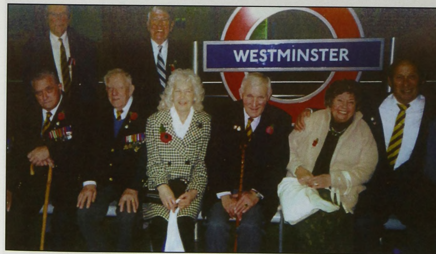
Members of Enfield Branch on route to Middlesex Guildhall for The Annual Service of Remembrance.