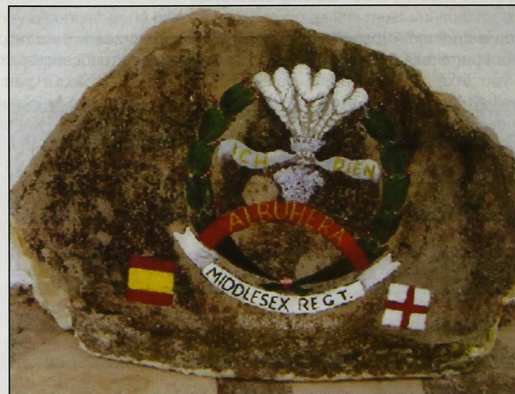
The renovated Albuhera stone at Moraira, Spain