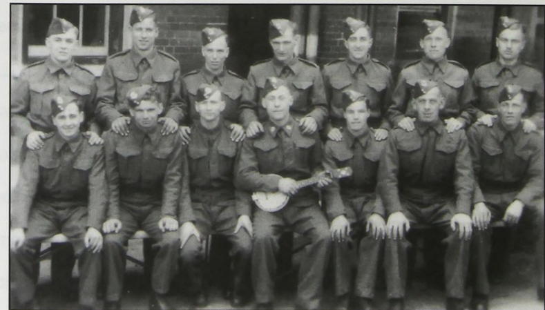
The conundrum who's who?

With reference to this photograph can anyone name the persons in the picture? Are they a concert party or a travelling troop as it is most unusual for a person to be depicted with a banjo who is badged Middlesex and is the only one with collar badges.