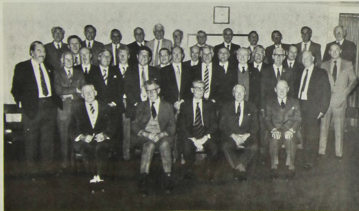
Members who attended the Luncheon