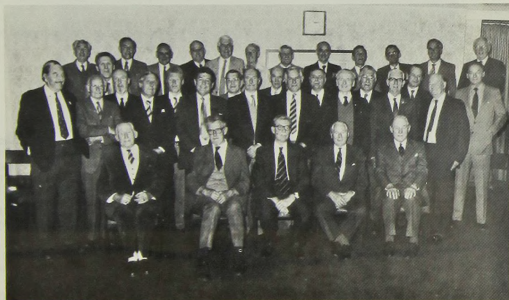
Members who attended the Luncheon