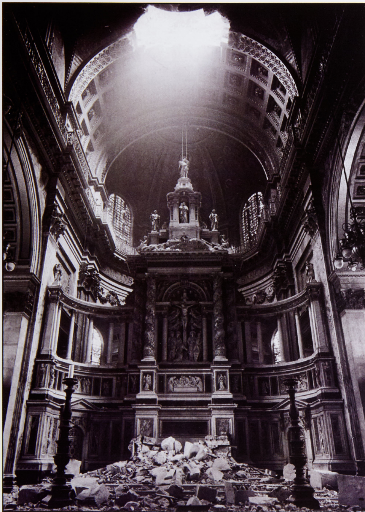
St Paul's Cathedral bombed