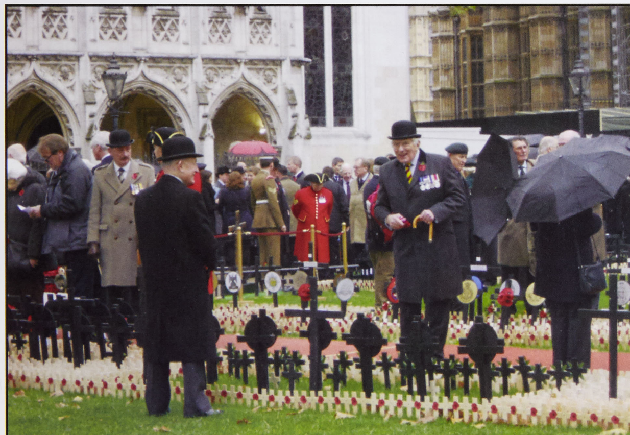
The Chairman at the Field of Remembrance, Westminster Abbey