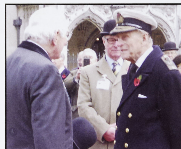
Prince Philip, HRH The Duke of Edinburgh talking with the Chairman