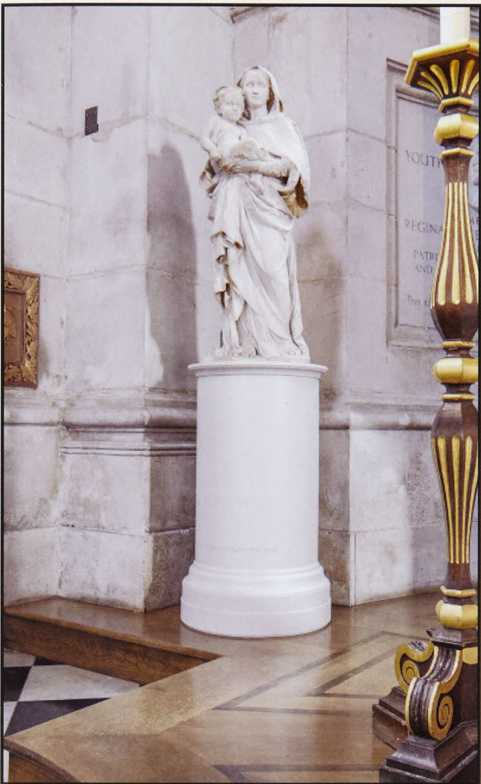
Garner Madonna - St Paul's Cathedral