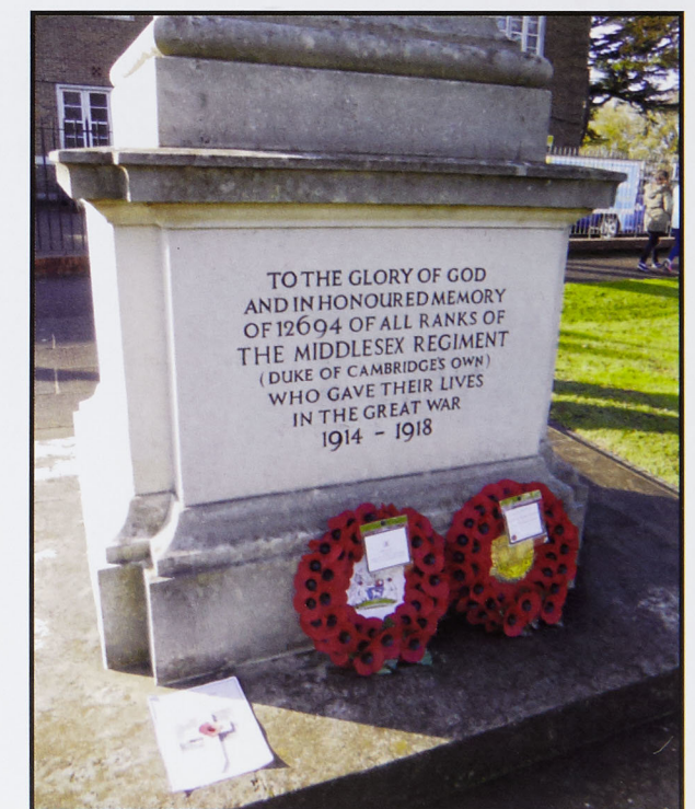
Regimental War Memorial at Mill Hill