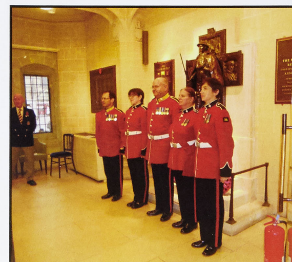
Quintet of the PWRR Band