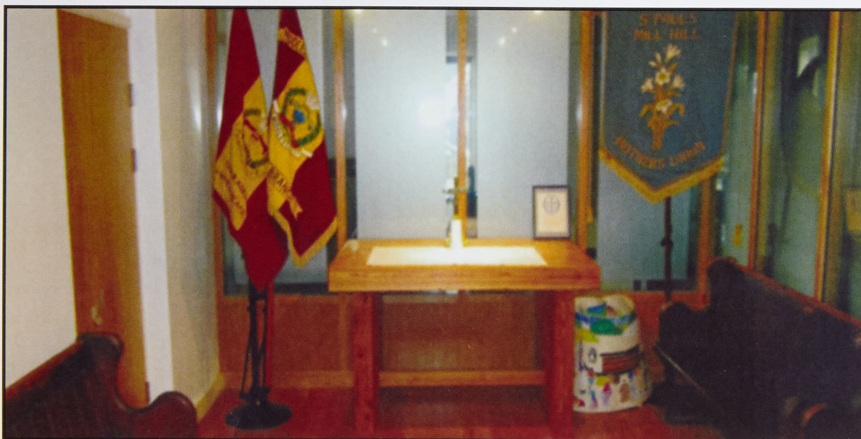
Standards of the Regimental Association laid to rest in St Paul's Church, Mill Hill