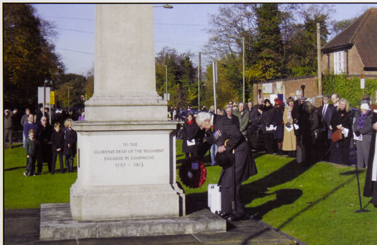
Remembrance Sunday, Mill Hill