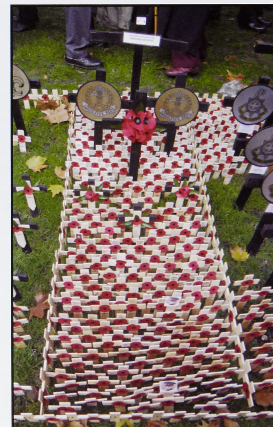
Middlesex plot, Field of Remembrance