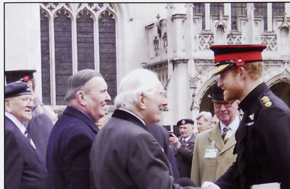
HRH Prince Harry and the Chairman