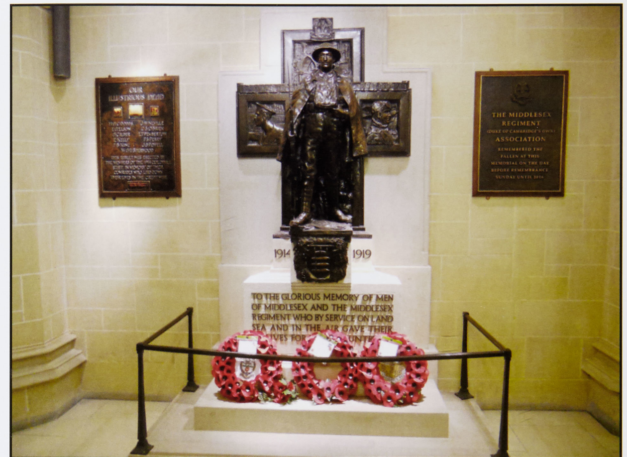
The Memorial at the Supreme Court