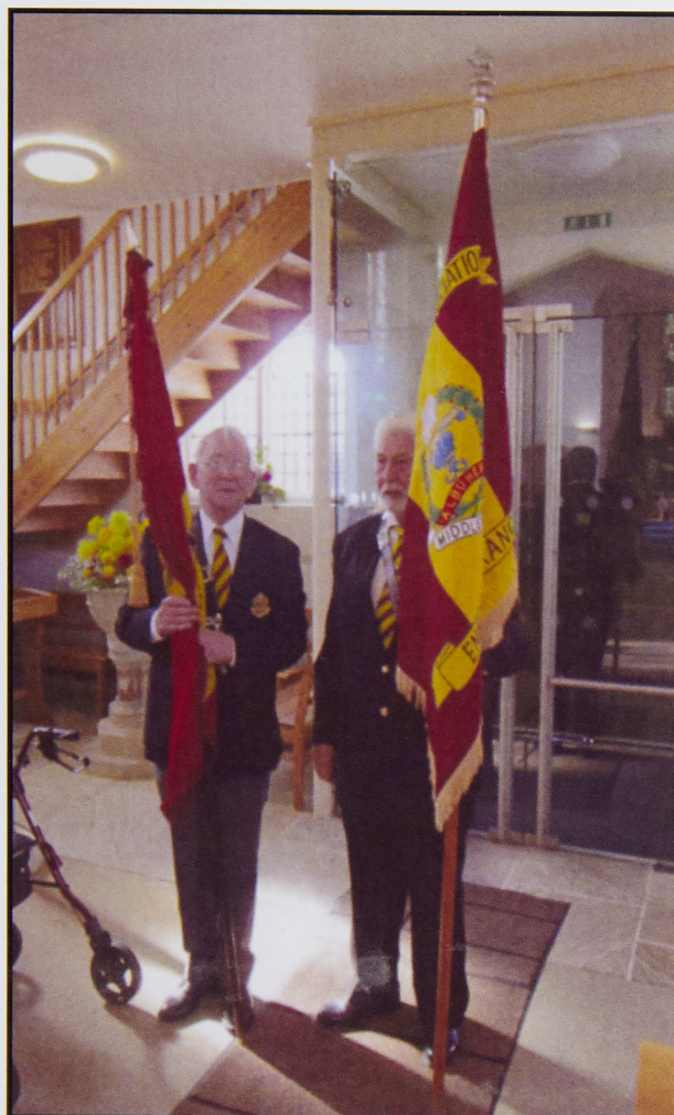
Standards at Mill Hill

At the end of the war the King decreed that all Service Battalions should be awarded a colour, "The King's Colour", in recognition of that service. This Colour was a union flag upon which was displayed the name of the regiment and the battalion number of the form of a circular "roundel". These colours were presented in 1919. After the war the battalions were disbanded and their Colours laid up. Those of eight of the Middlesex Regiment service Battalions were laid up here at St. Paul's in 1923 and hung in prominent position in the church.