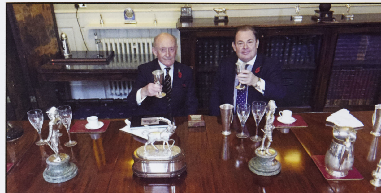
The President and Secretary at St James's Palace