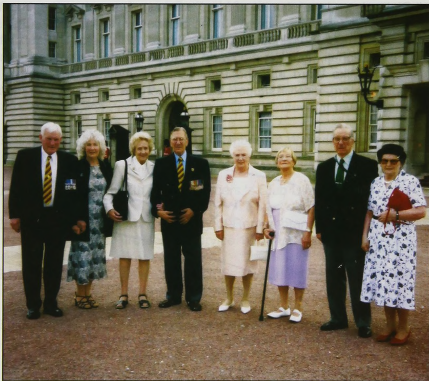
DIEHARDS AT BUCKINGHAM PALACE