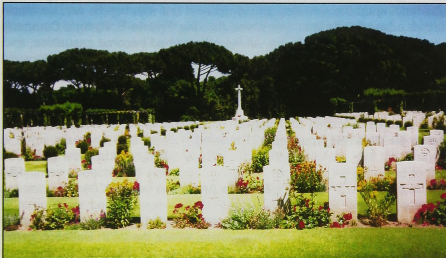
The Commonwealth War Grave Cemetery at Anzio

trees everywhere, setting off the long rows of white headstones. The good doctor waited patiently while I walked along the quiet avenues searching for our badge among those of many other famous regiments and noting some familiar names, although matching them to faces was not easy after a lapse of 60 years - old men forget, as they say, but not completely. There is a smaller military section in the town cemetery which we visited briefly, and here again the regimental badge stood out here and there, increasing the feelings of sadness about the loss of all those young men.