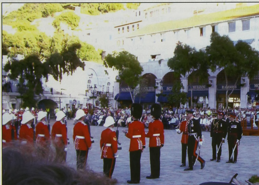
The Ceremony of the Keys - Gibraltar 2004

the government ministers could not count). Since then, battalions of the 57th and the Middlesex Regiment have returned to the Rock for two year tours in 1804, 1892, 1914, 1919 and finally in 1963. Probably the final organised group of Die Hards returned for seven days on the 8th October 2004. It is ironic to note that it was the 57th first overseas posting and the Middlesex Regiment's last overseas two years posting before being absorbed into the Queens Regiment in 1966.