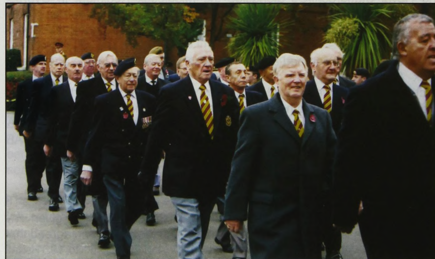
Diehard contingent march past at Mill Hill