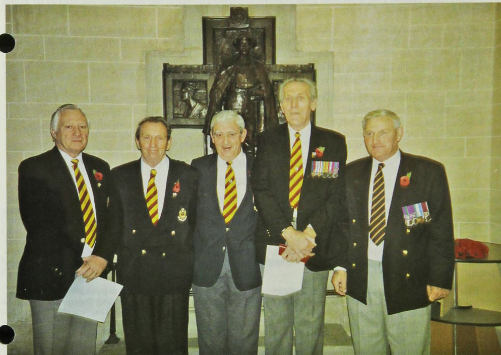
Hounslow Branch on parade.