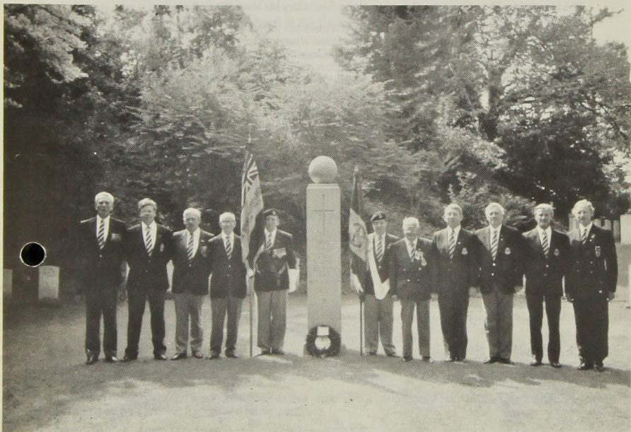
THE HOUNSLOW BRANCH ON PARADE AT MONS AUGUST 1990