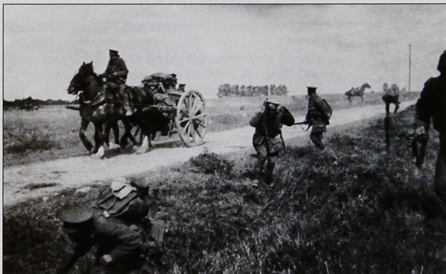
A Transport column of 1st Middlesex Regiment under shrapnel fire during the battle of the Marne, Signy Signets road France 8th September 1914