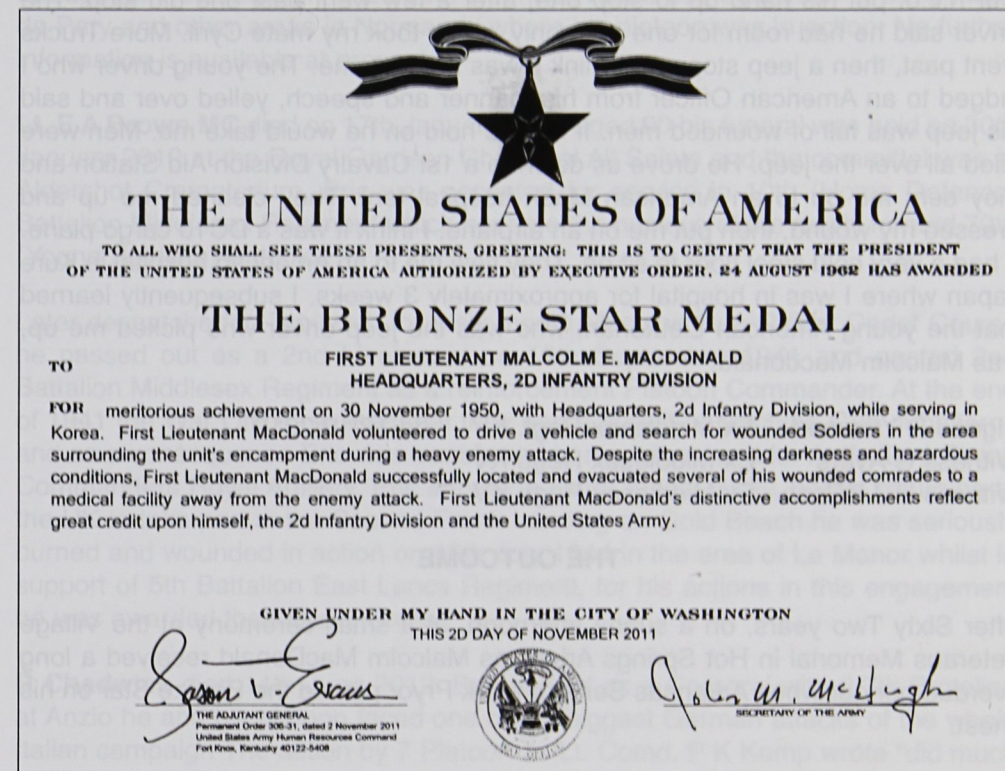
A copy of the Bronze Star Medal Certificate