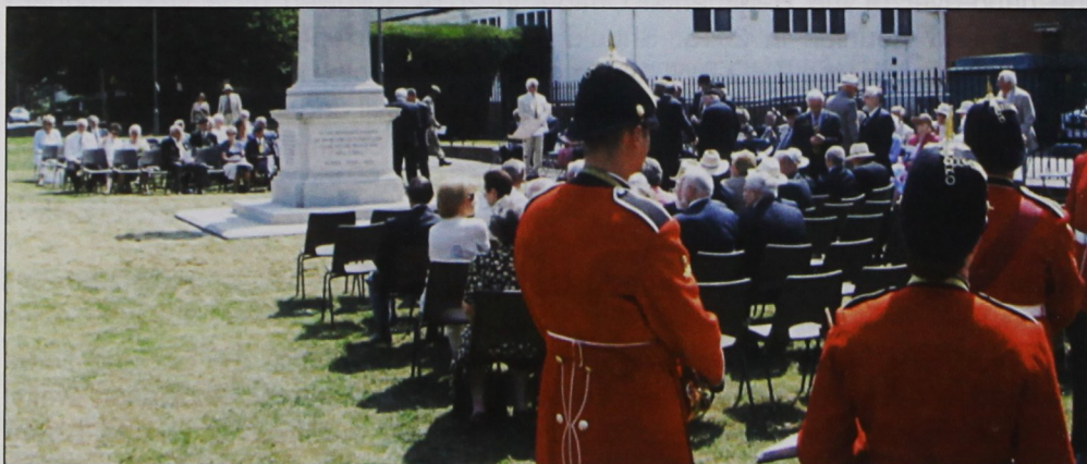
The congregation assembles