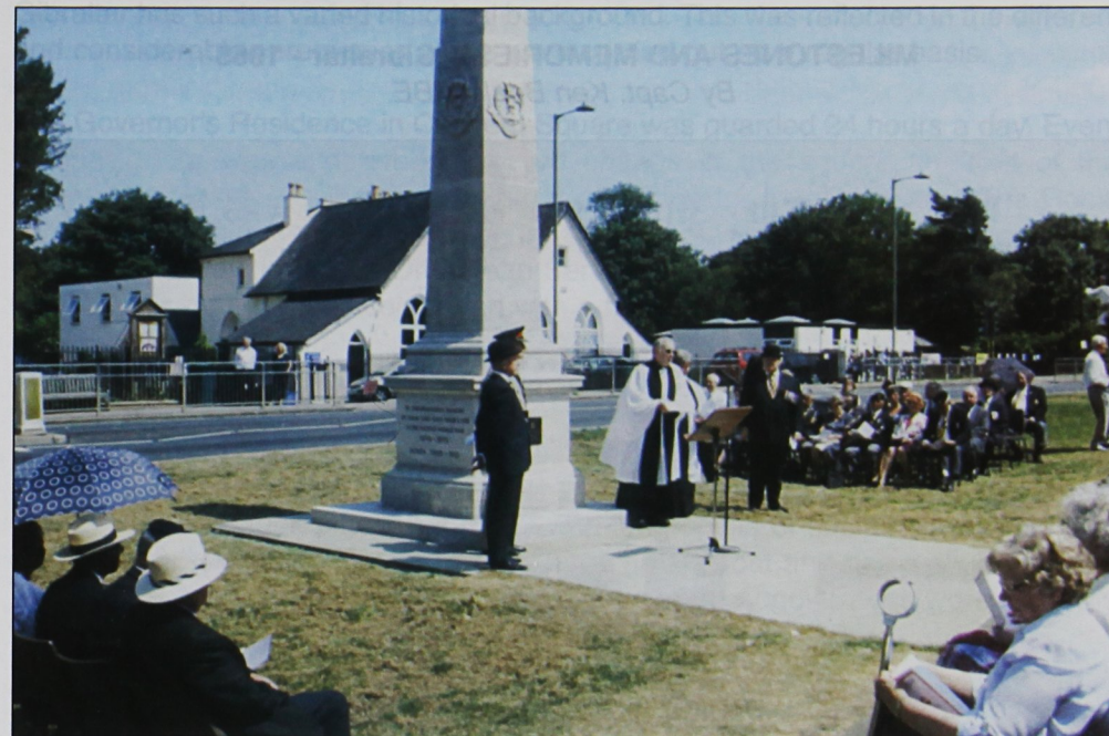
The service commences