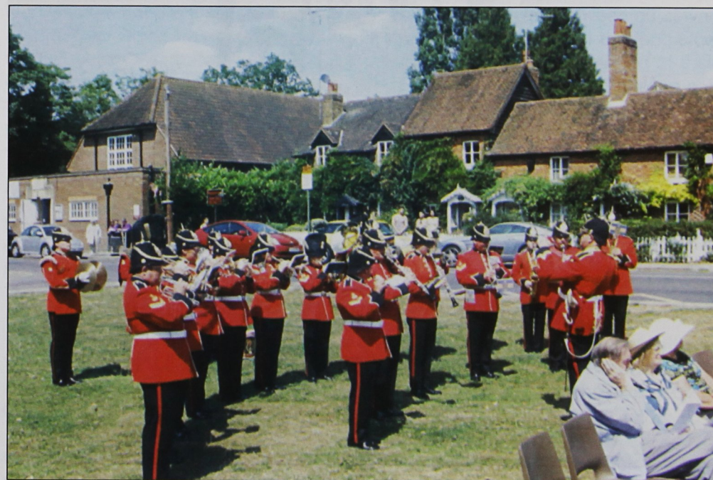
The band of PWRR