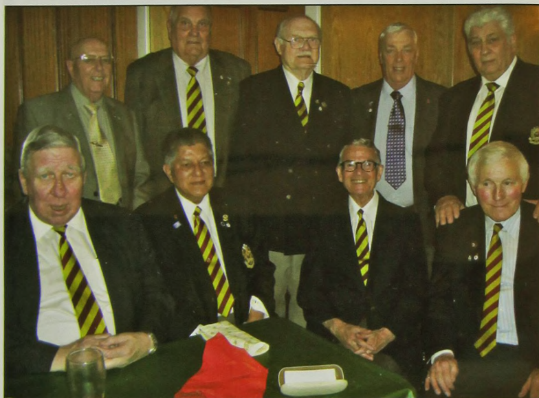
Members of Enfield Branch at their Diamond Jubilee Lunch