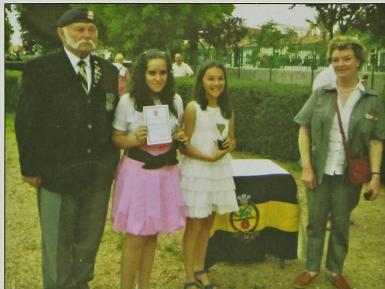
Joint Winners of the PWRR Trophy

It has been announced that the fortifications and aqueduct of Elvas have been classified as a World Heritage site. The fortifications with a perimeter of 8 to 10Km and include an area of 300 hectares is now recognised as the largest of this type of fortification in the world.