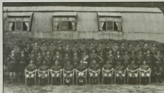
1st Bn The Middlesex Regt (DCO) WO'S and Sgts Mess San Wai Camp, Hong Kong, March 1952

The excellent photograph in the spring Die-Hards Newsletter of the Coronation Party has prompted me to add some more milestones and memories. On secondment to the Middlesex Regiment at the start of 1952 I became a Die-Hard. One of the earliest photographs I have is of the WO's and Sgts Mess.