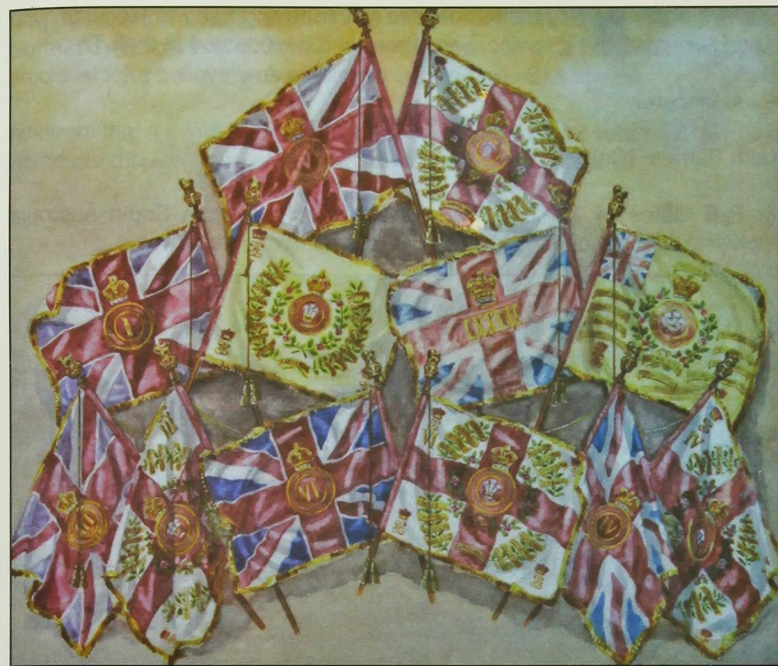
Colours of six Battalions of Mx Regiment

I enclose a photograph of that painting, which my wife bought for my birthday many years ago, after I had greatly admired it at an antiques shop in Leominster. I was 'scared-off' by the price but God bless my wife for indulging me!