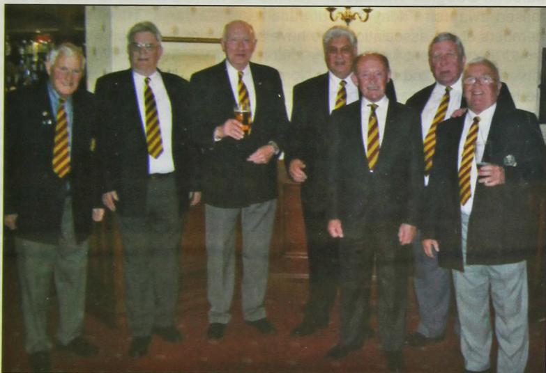
Members of Enfield Branch at the Annual Reunion