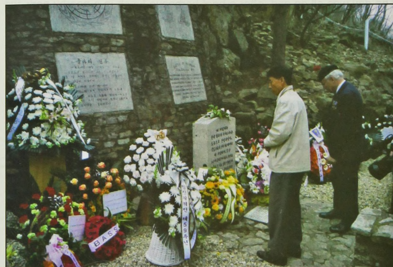
The Gloster memorial in the hillside at Solma-ri

The final day of commemorations and services was devoted appropriately to the Glosters and their famous stand on the banks of the Imjin. So we headed north to not far from the DMZ where that Regiment's Memorials lie at the foot of a steep hill near the village of Solma-ri.