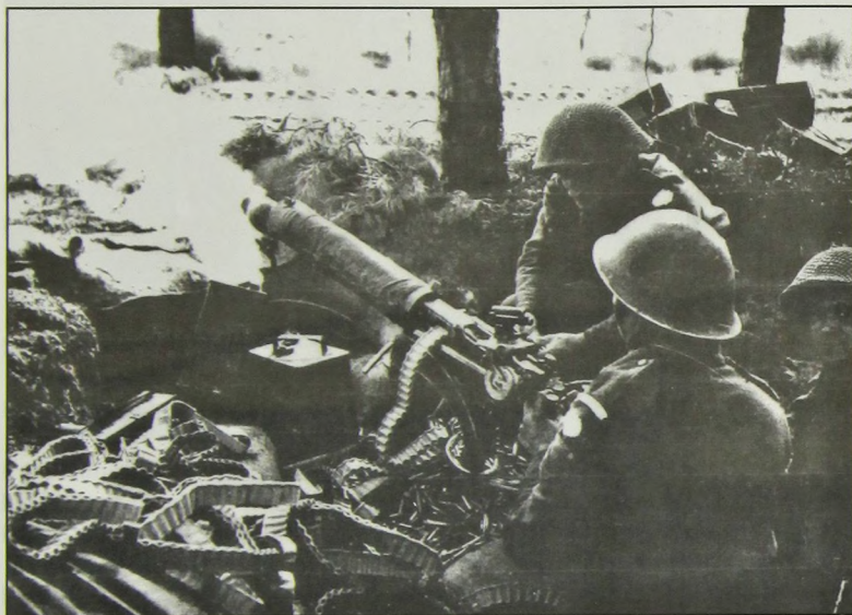
Mx MMG crew in Belgium - Autumn 1944

Mr P E Gates ex 7 Pln C Coy 1st Bn MX writes from South Australia enclosing a photo of an MMG crew, and commenting as follows