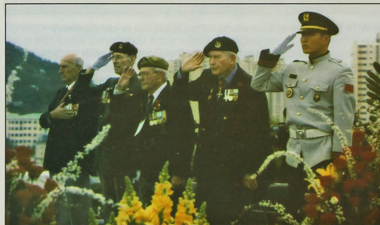
Australian, Canadian, New Zealand & UK wreath layers salute

That afternoon we assembled at the beautifully landscaped cemetery with all its Memorials for the Commonwealth Commemoration Service. Marching by contingent up to what is known as the flag area, we halted in front of a solid phalanx of dignitaries - ambassadors, generals, admirals and military attaches in all their finery.