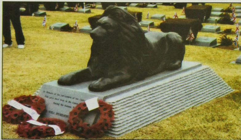
New British Lion Memorial in UK section of UN Cemetery